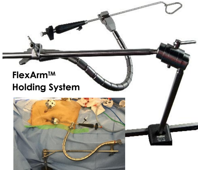
FlexArm™ Holding System